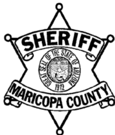
Joseph M. Arpaio, Sheriff